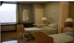
Medical Acute Care Unit - Boston, MA