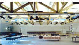
Charles River Day School - Dover, MA