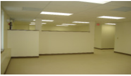
St. Polycarp Village - Somerville, MA