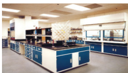
Research Biochemicals Lab - Natick, MA