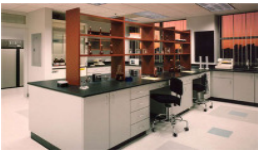
Alkermes Lab - Cambridge, MA